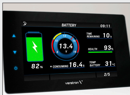
Intelligent Battery Sensor (IBS) screen to keep your energy supplies under control