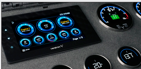
The VMH series look and feel gives an elegant and stylish touch to your dashboard

Customize your screens with more than 40 available data