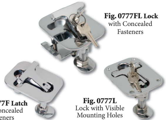
Fig. 0777FL Lock with Concealed Fasteners