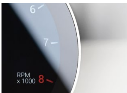
The finest quality in every detail