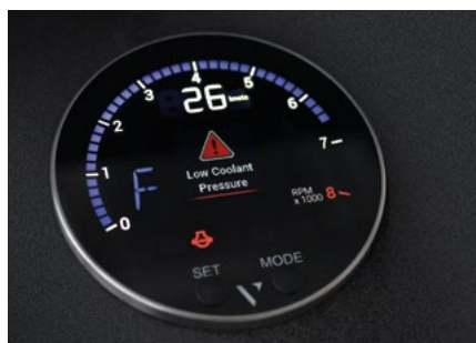
Setup local alarms and send them to other devices via NMEA 2000®

The VMH 35 has an embedded GNSS receiver to support and show navigation information, while it is able to monitor analogue input directly, such as fuel, trim, and tachometer. A special input is dedicated to the Veratron IBS (Intelligent Battery Sensor). It can provide critical 12V battery monitoring information. All these data are distributed to NMEA 2000® thanks to its embedded certified gateway.