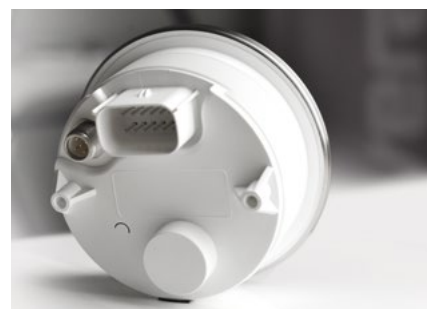
Water-sealed connector and NMEA 2000® DeviceNet plug