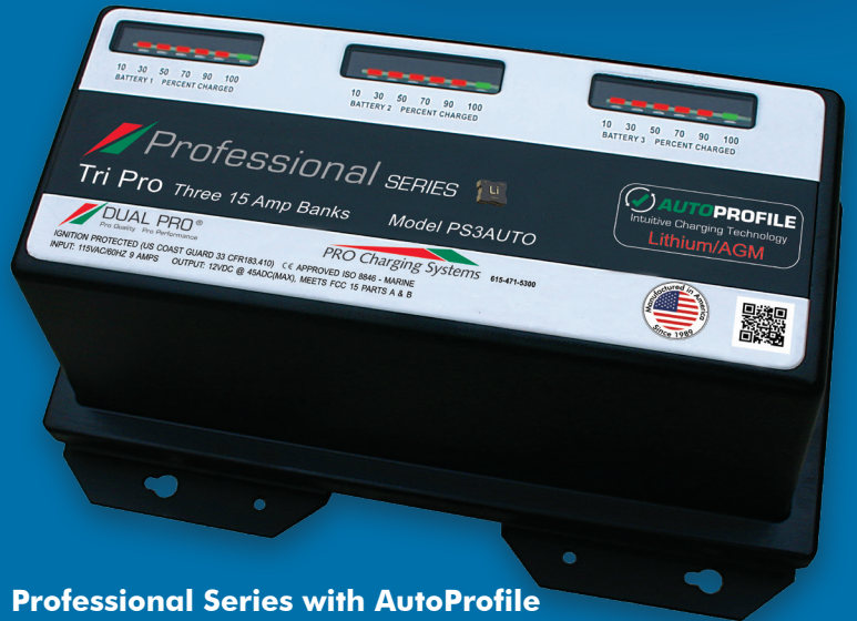
Professional Series with AutoProfile (with 1, 2, 3 or 4) 15 Amp banks