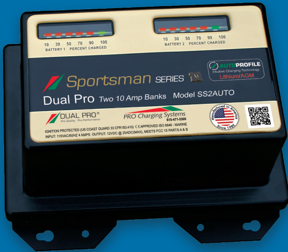
Sportsman Series with AutoProfile (with 1, 2, 3, or 4) 10 Amp banks